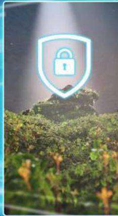
> High security