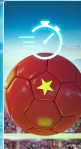
> Simple and fast login