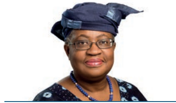
Dr Ngozi Okonjo-Iweala Non-executive Director