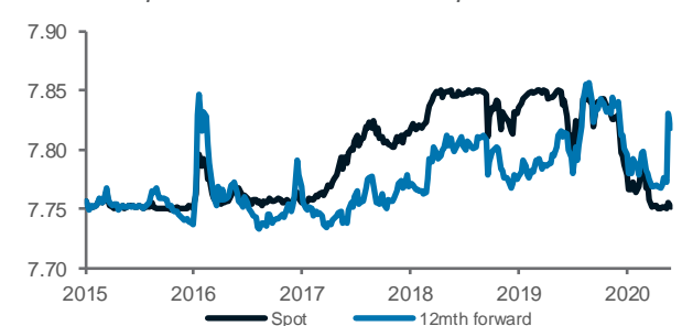
USDHKD spot and 12-month forward price