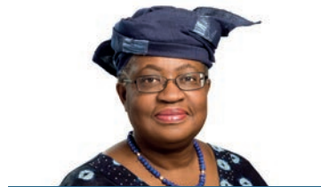
Dr Ngozi Okonjo-Iweala Non-executive Director