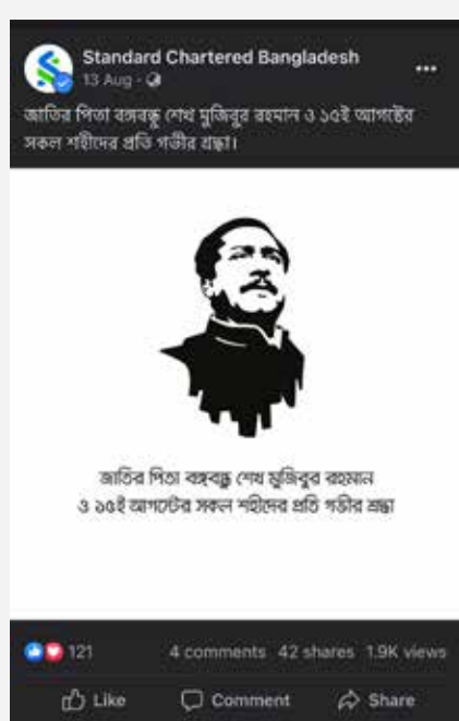
Animated post for Standard Chartered Bangladesh Facebook page. Date: 13th Aug 2021

To mark the National Mourning Day, Standard Chartered Bank staff wore black ribbons. Date: week of August 16th to 19th 2021