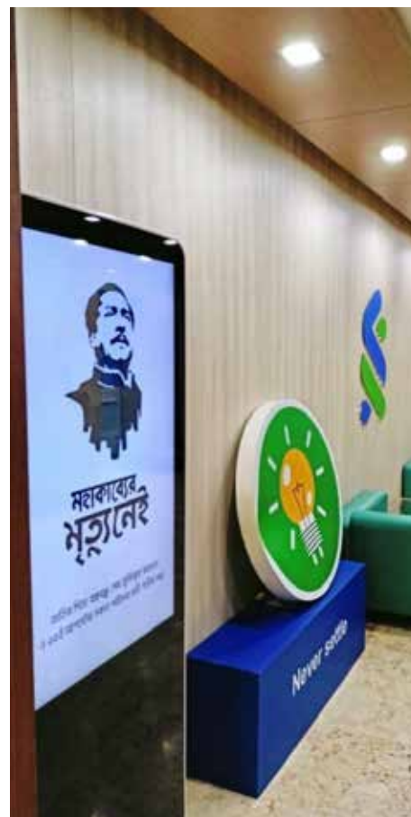
Digital Branding inside Head Office Date: 15 – 31 Aug 2021