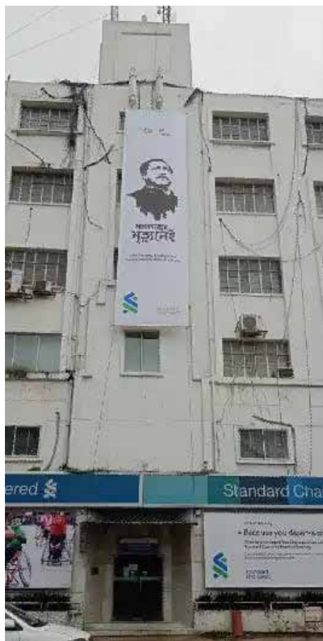
Branding in front of Chattogram Office Date: 1 – 31 Aug 2021