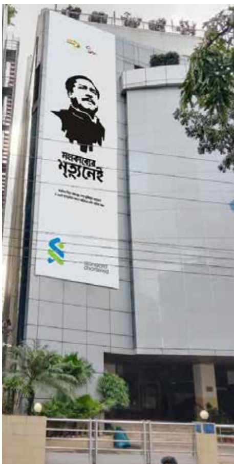
Branding in front of Dhaka Head Office Date: 1 – 31 Aug 2021