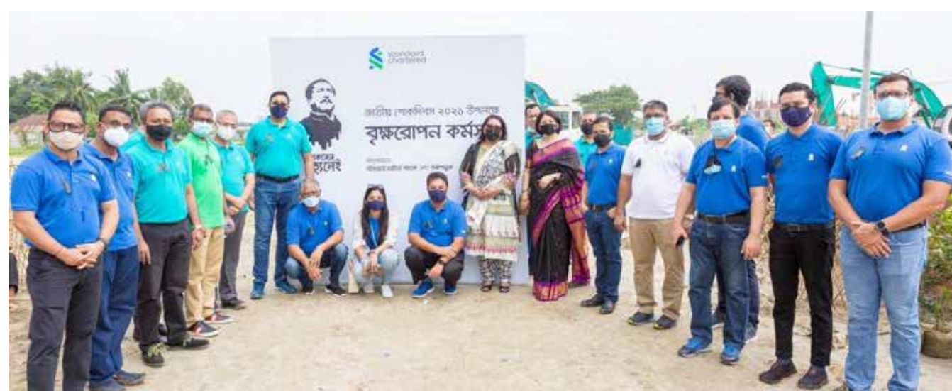
The Bank's country management team and colleagues participated in a tree plantation programme, symbolising the Bank's commitment to the long-term growth of Bangladesh and the legacy of Bangabandhu Sheikh Mujibur Rahman. 100 trees were planted in a single day. Location: Madani Avenue, Dhaka; Date: 27th Aug 2021.